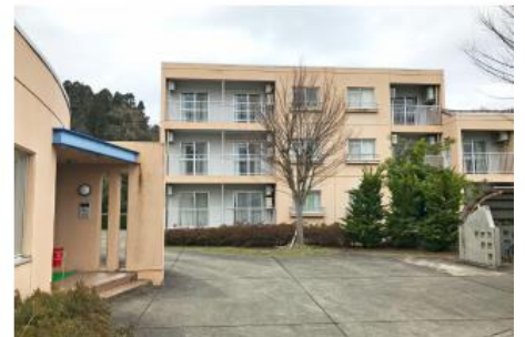
Gofuku International House