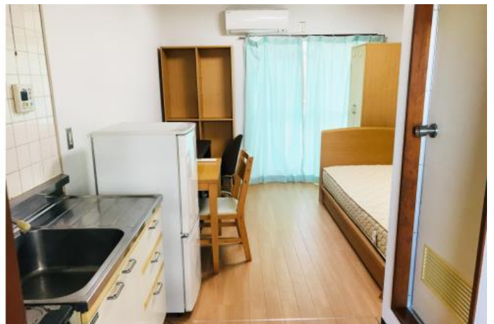
Sugitani International House