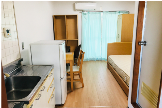
Sugitani International House