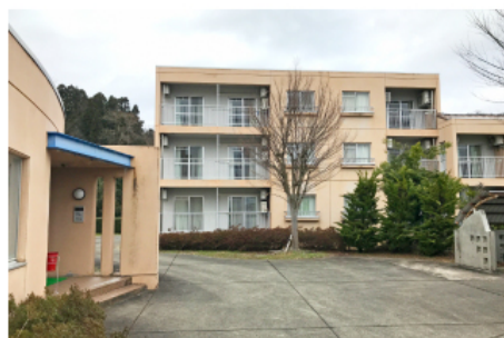
Gofuku International House