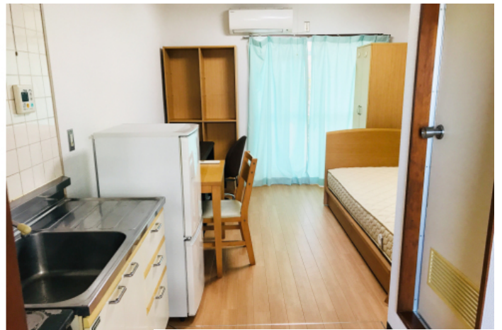
Sugitani International House