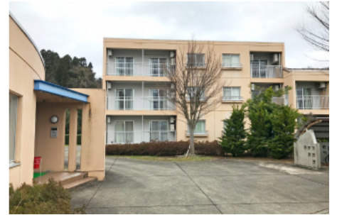
Gofuku International House